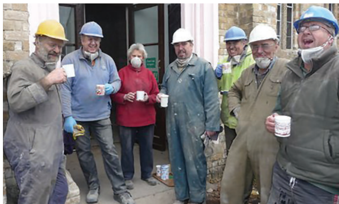
The Rotary Wreckers of Fordingbridge take a break from their work on the community centre